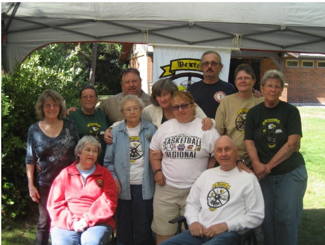
First Cousins 2018