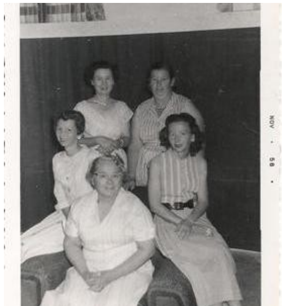
THE DEXTER WOMEN

You know you're from Idaho when... You've had to remove skunk smell from a: pet, vehicle, relative, sleeping bag (or any other camping equipment) or body part more than once in your life.